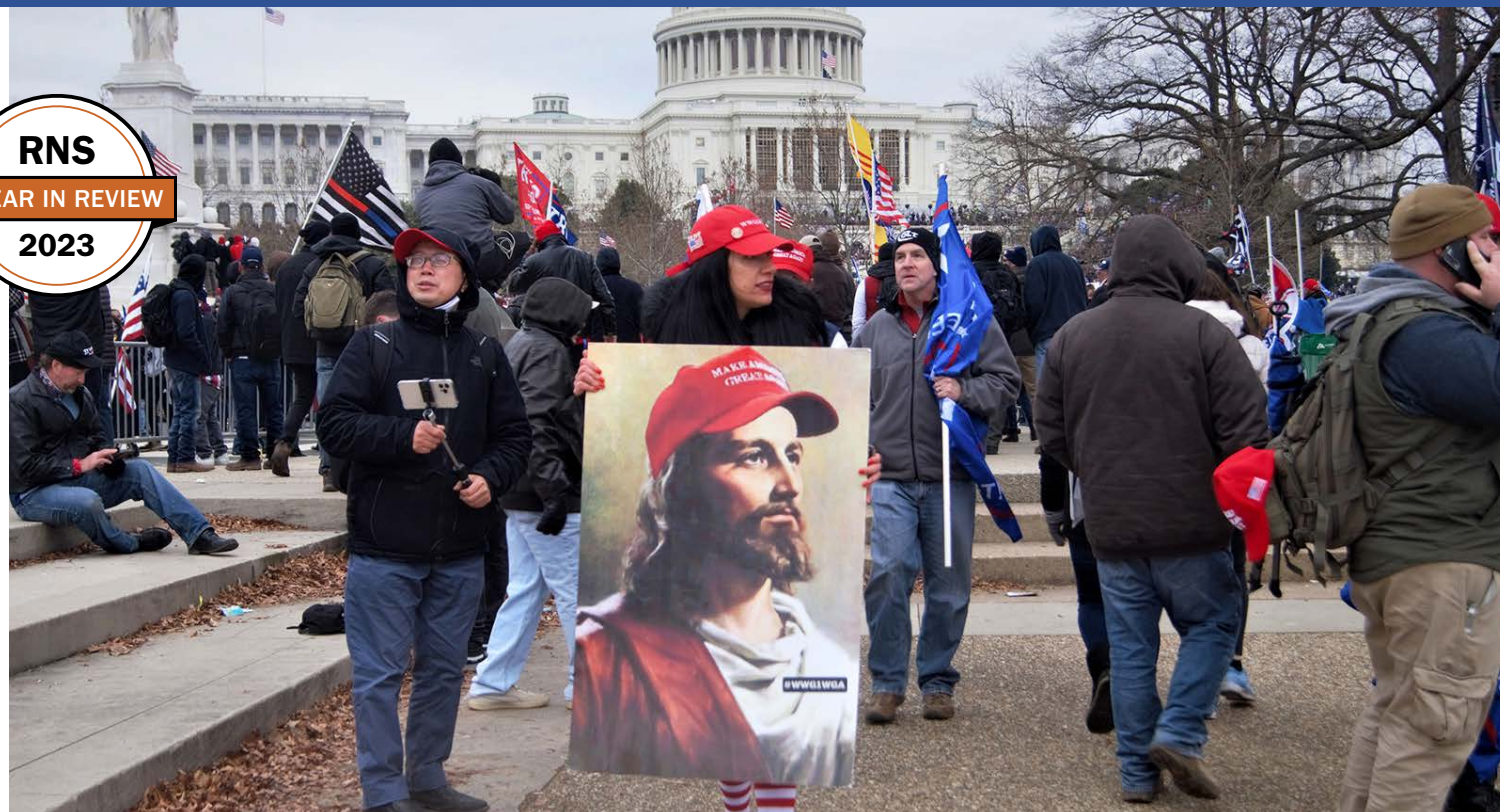
White #MAGA QAnon Jesus carried during the Jan. 6 insurrection at the Capitol.