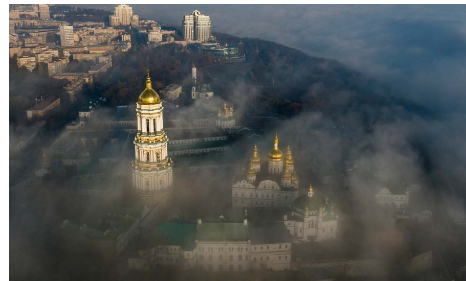
The thousand-year-old Monastery of Caves, the holiest site of Eastern Orthodox Christians, in Kyiv, Ukraine.

RNS has kept a watchful eye on important trends and their religious impacts, including the increase in the numbers of the religiously unaffiliated, or so-called "nones," who include atheists, agnostics, "nothing in particular," and those who hold strong spiritual beliefs; people whose lives have been transformed by, not faith, but psychedelic drugs through which they have healed and connected to the mystical and divine; and the impact of artificial intelligence as it begins to play a role in faith communities and expression.