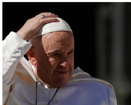
Pope Francis at the Vatican, March 15, 2023.

Pope Francis' agenda includes welcoming LGBTQ believers, expanding women's roles, and reaching out to the farthest reaches of the globe, even as he tackles corruption with a historic prosecution of financial mismanagement and fraud. It's a tall order, especially in the face of criticism from traditionalists and the draining fight against sexual abuse. RNS has covered the Catholic story in all its complexity from Rome and Washington.