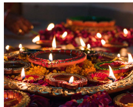
Earthen lamps lit for Diwali.