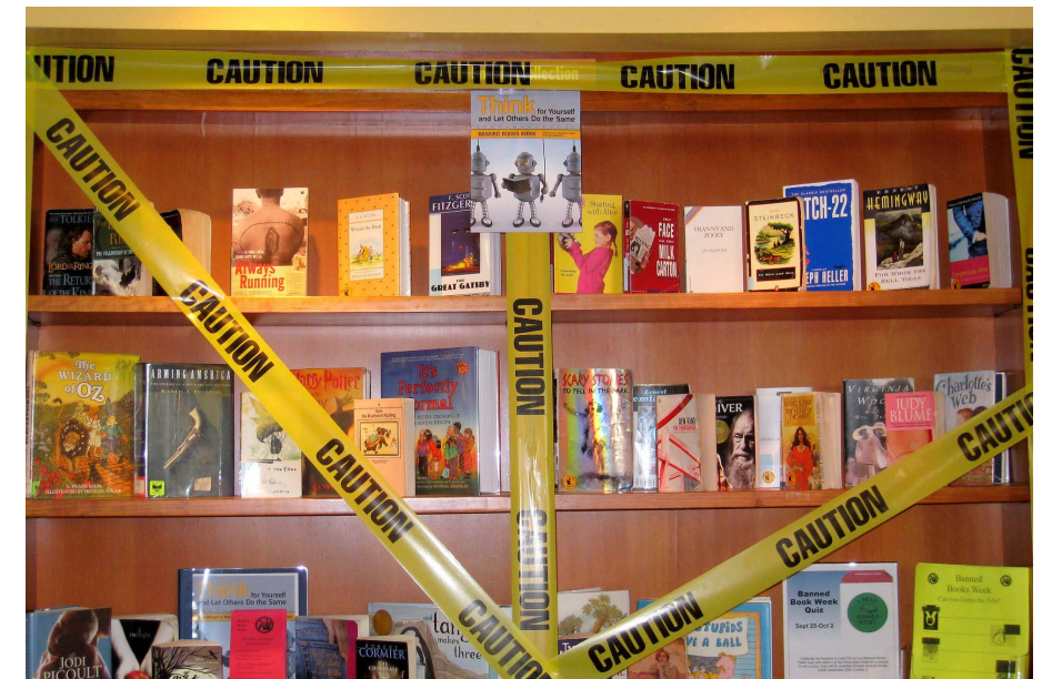
A Banned Books Week display in San Jose, California.

RNS honed in on the turmoil in the Southern Baptist Convention over its own attempts to get a handle on sexual abuse reporting, even as it enforced its rules against women in leadership, disfellowshipping two churches with female pastors, including one founded by one of the country's most beloved and best-known preachers, Rick Warren.